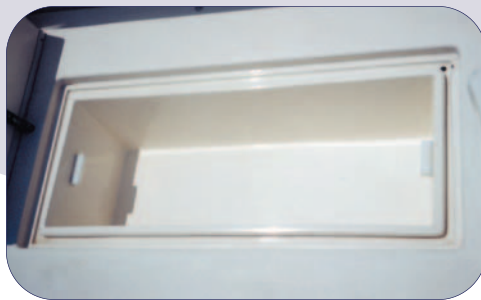
Built-in fish boxes and access hatches for all below deck hardware are standard