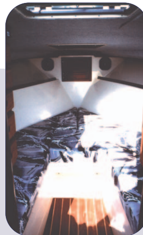
Below decks, the 245SX has increased headroom, sleeps two in exceptional comfort, provides ample storage space