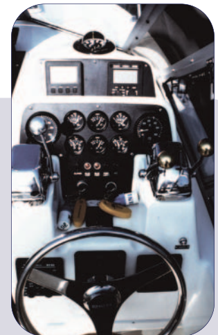
The command helm station provides all the instrumentation necessary, and plenty of room for electronics